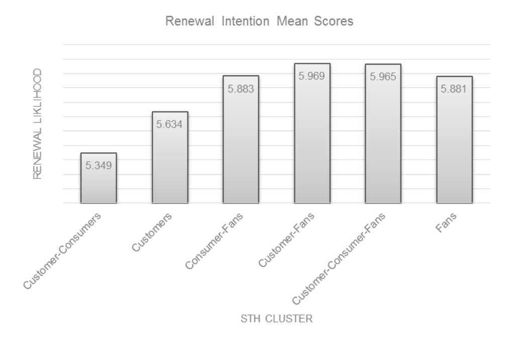
Figure 2. Overall Likelihood of Renewal.