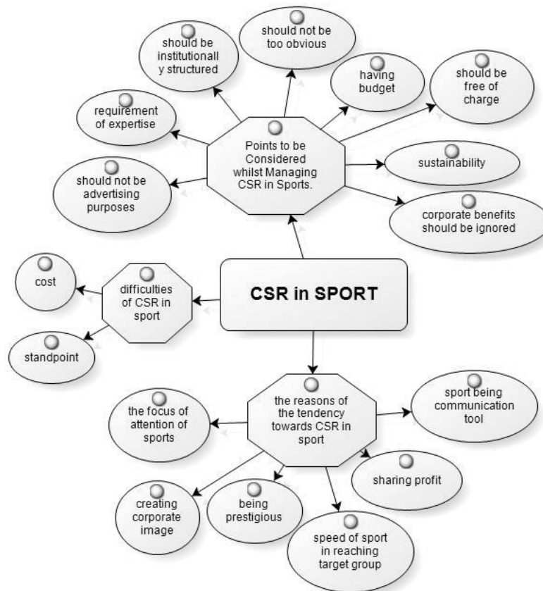
Figure 1. Corporate Social Responsibility in Sport Based on Research Findings.

The findings were compiled in two parts: the reasons of the tendency of sports clubs to CSR in sport and challenges and difficulties that should be considered in CSR.